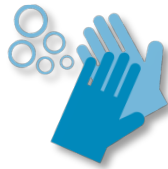
Fig. 2 – Hand Sanitiser Points